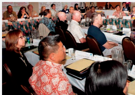
Representatives from businesses and government agencies gathered with language educators for the Hawaii Language Summit.