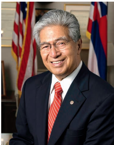
Former U.S. Sen. Daniel K. Akaka of Hawaii is the Sixth Annual Language Flagship Leadership Awardee.

Akaka reiterated his support for NSEP language initiatives in his acceptance speech for the Sixth Annual Language Flagship Leadership Award. "Foreign language proficiency is important to the future, as is cultural understanding," said Akaka. "[This combination] is so important to the lives of our people, our states, and our countries—to the point where it affects our national security."