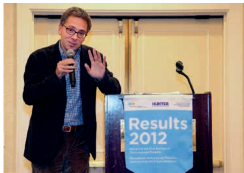
Ian Bremmer, president of the Eurasia Group, emphasized the importance—to business and national security—of understanding global perspectives.

A related workshop was held on Nov. 15, 2012: Increasing Postsecondary Language Proficiency. In partnership with ACTFL, Flagship directors met with 25 educators representing the gamut of institutions of higher education (from community college to Ivy League) to discuss what makes the Flagship model successful and how to develop a Flagship-style program on any campus. Presentation and discussion topics included how to develop successful Flagship components, choose the appropriate Flagship elements for the participants’ campuses, gain institutional support, and adapt the Flagship model to implement a Flagship-style program on participants’ campuses.