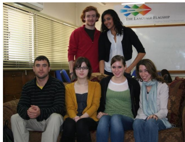
UCLA Russian Flagship Scholars

In 2011, The Language Flagship will start graduating the undergraduates who started the program in 2007. When NSEP transitioned The Language Flagship in 2007 from the small-scale pilot Post-Baccalaureate to the larger undergraduate program, it recognized that graduating students from across majors with certified proficiency levels as well as rigorous overseas study and internship experience would take time. Flagship currently has 1,134 students enrolled in programs nationwide and expects continued growth and expansion. Many of these students desire to pursue a career in government service and to utilize their linguistic and cultural skills to serve the country.